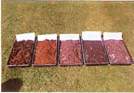
A variety of growing media using different aggregate fines and organics